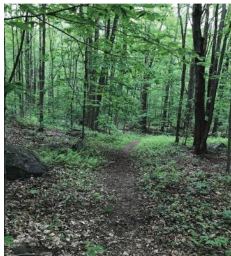
One of the easy-to-follow trails at Houlihan Woods/Michael Giordano Tribute Area.